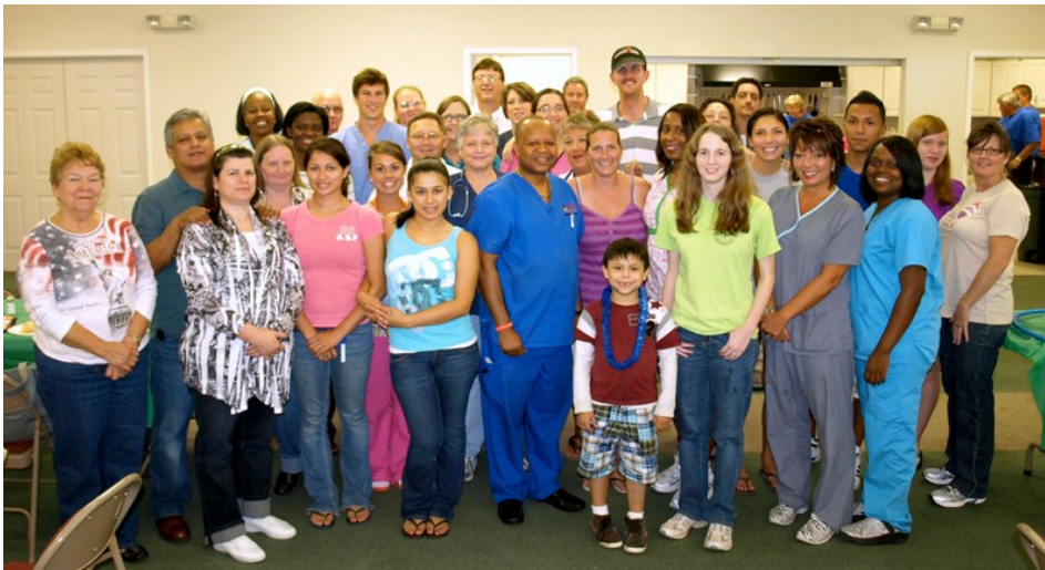
Medical Mission Team

The number of uninsured in America continues to grow just as unemployment rate dictate the number of uninsured. In towns with emergency rooms the number of visits has increased. However, in rural America where some are not privileged to visit ER the suffering is worse. HIMM can hear the cry of the rural American population.