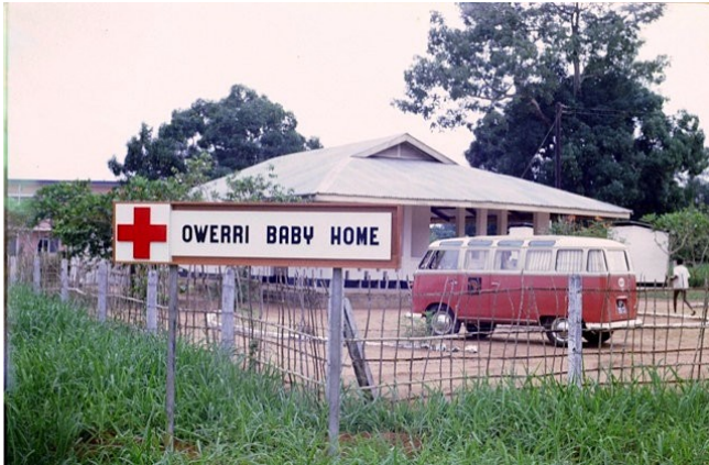
Owerri Motherless Baby Home in 1963